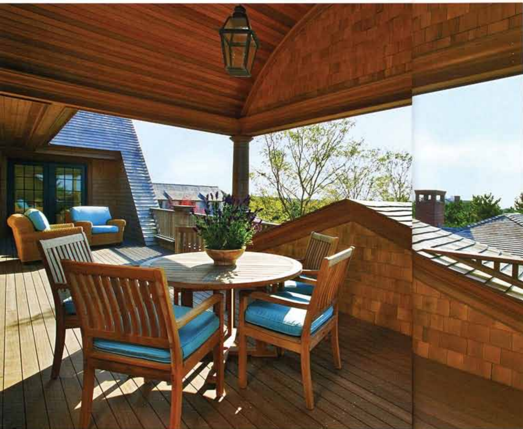
Outdoor living spaces in the form of porches and patios take in views of the extensive lawns and the ocean beyond.