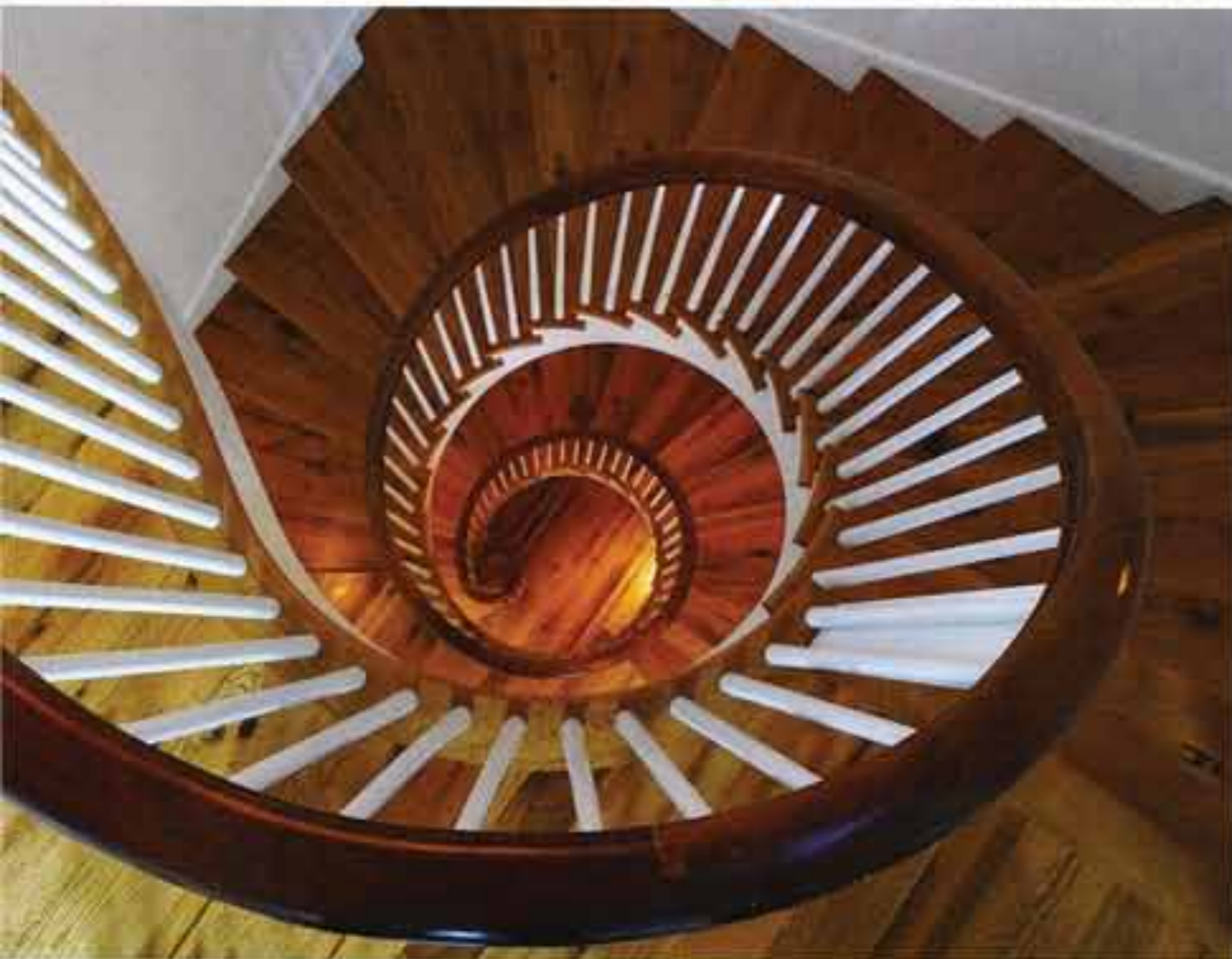
This page: Craftsman Dave Renner built the dramatic spiral staircase that leads to the master bedroom wing—complete with master bath and home office (opposite). The straight staircase leads to the children's rooms.