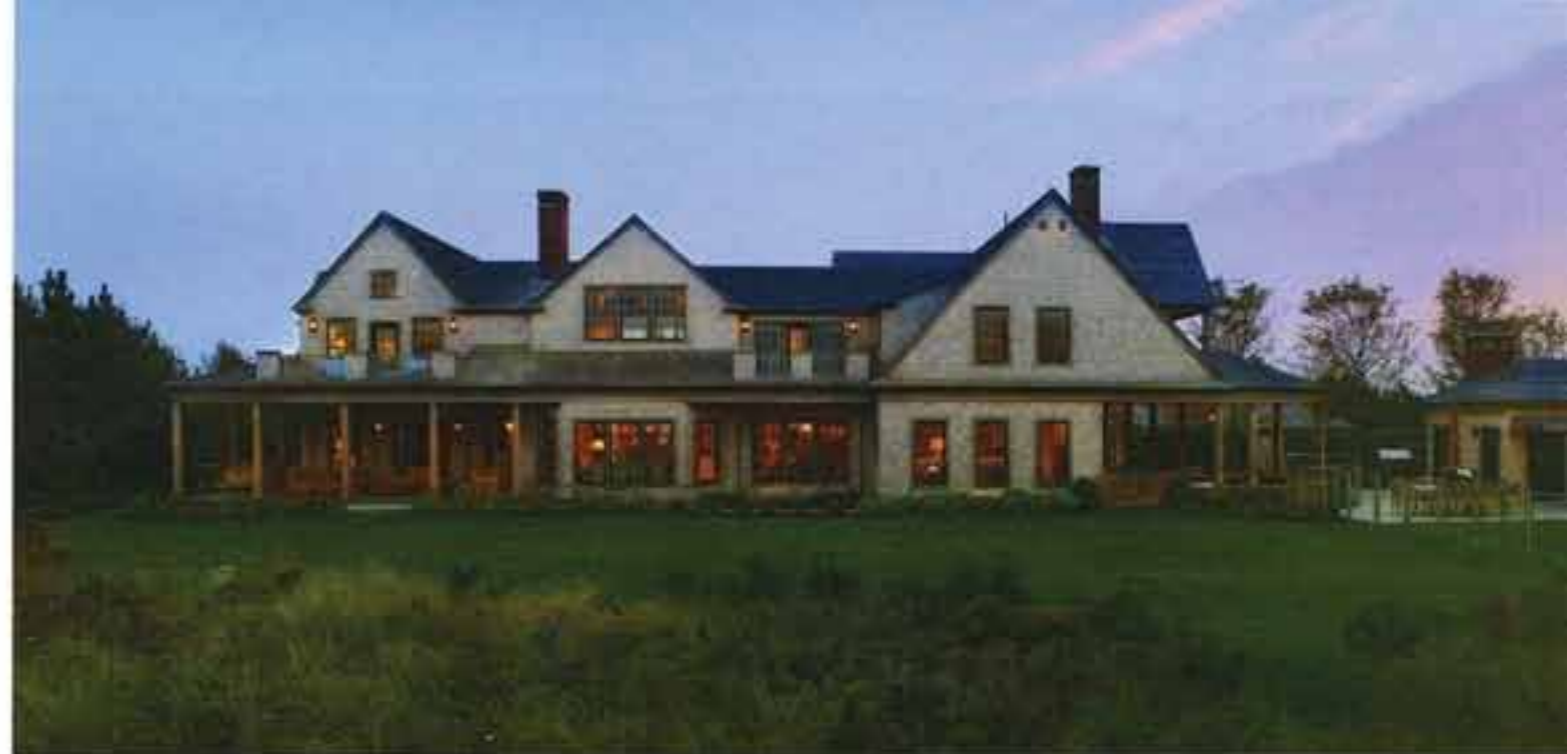
The Shingle-style home on Eel Point Road on the island of Nantucket is a real dream house getaway. The Nantucket Architecture Group and J. Brown Builders worked closely together to create impressive exterior trim details (shown opposite).